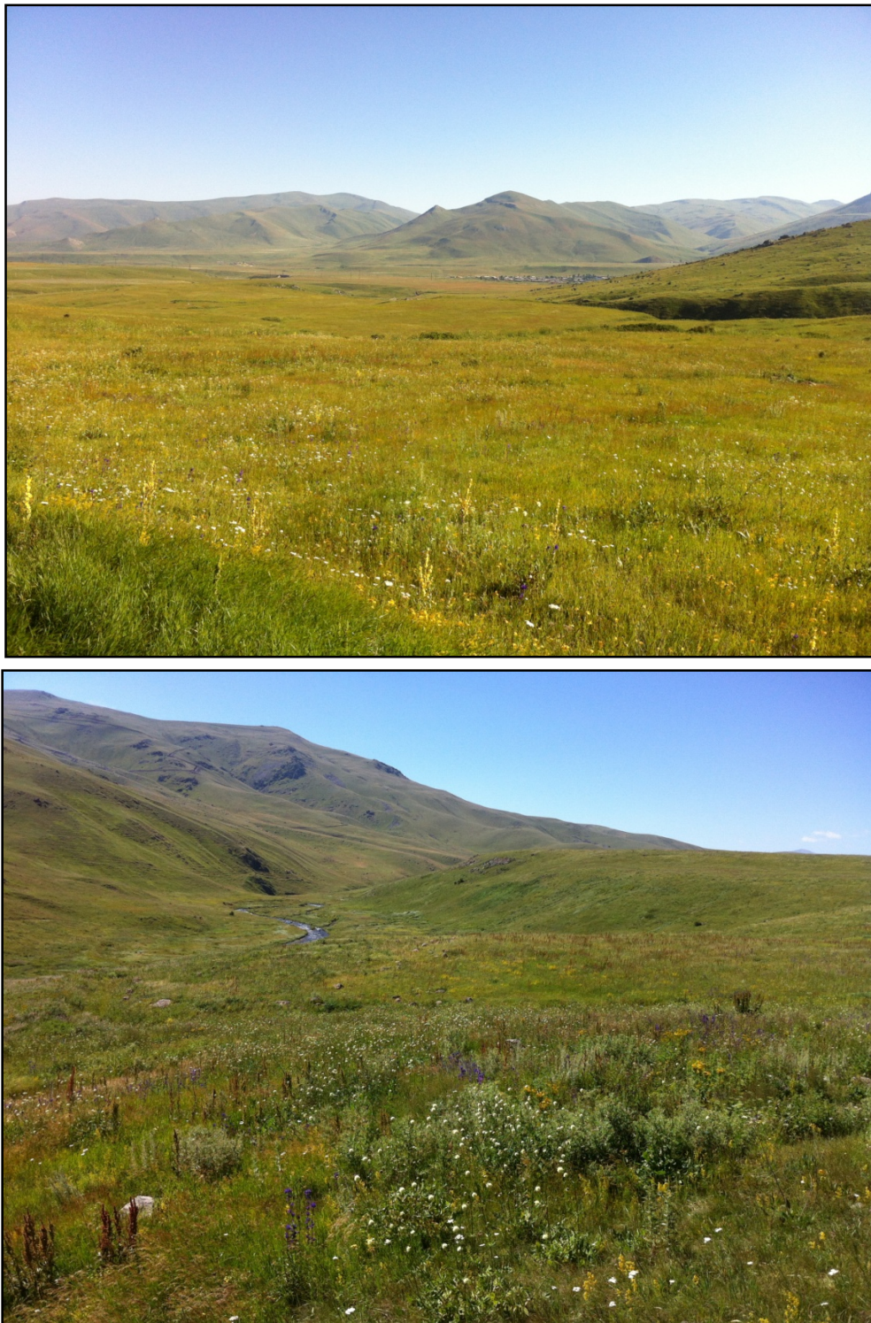
Figure 4.19.3: Photographs of Project area Terrain

a. Rolling Topography on Valley Bottom, View to South (top), b. Mountain Topography, View to North (bottom)