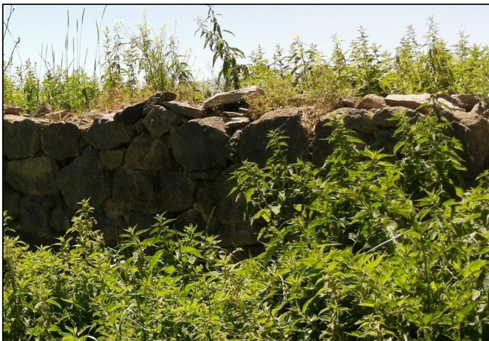
Figure 4.19.2: Photographs of Archaeological Resources in the Project area

a. Possible Bronze Age Tomb (top), b. Stone Remains of Ancient Architecture (bottom)